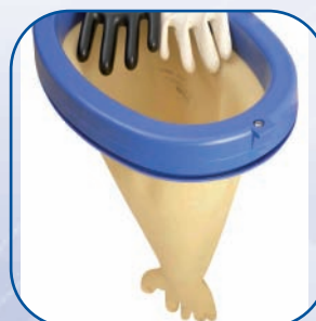
Replacement Gloves and Gloveports