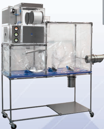
Flexible Dispensing Isolator