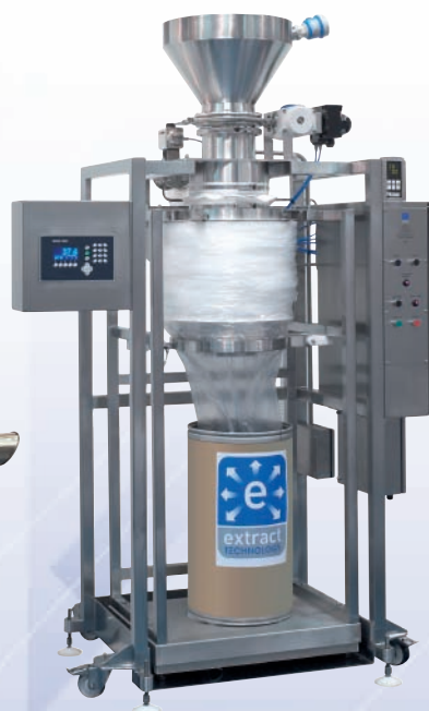
Inward Inflating Continuous Liner