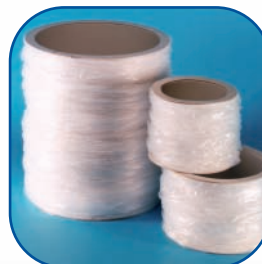
Disposable Liner Cassettes