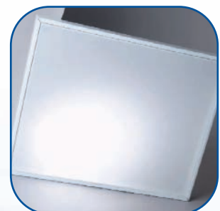
Perfect Laminar Flow Screens