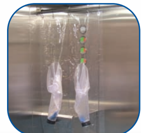
Flexible Containment Screens